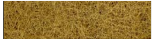
THE OTHER GUYS